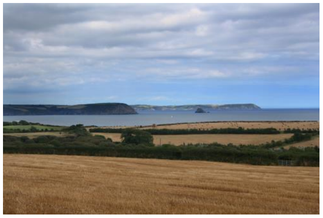
View across Gerrans Bay from farm entrance

Take the A30 from Exeter to Cornwall. Leave the A30 at Innis Downs. At roundabout, take 1st exit onto A391 to St. Austell. From St Austell take the A390 towards Truro. Bear left on the B3287 to Tregony. From Tregony follow the signs for St Mawes for 7 miles to Trewithian. Turn left at the sign for Gerrans, Portscatho, Trewince Manor etc. Stay on this road, following signs for St Anthony, to Trewince Farm one mile beyond Gerrans village.